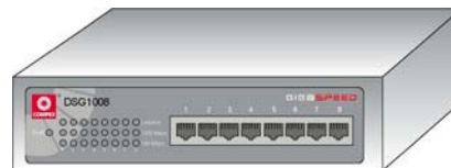
Figure 1 Compex DSG1008

The 8 Port 10/100/1000 Base-T compact switch is designed for easy installation and high performance in an environment where bandwidth intensive applications are needed. It offers ease of use to any users by offering auto-negotiation on all ports easily linking any Cat 5e cables to the switch. Its small form factor is designed to allow it to be placed even in the tightest closet.